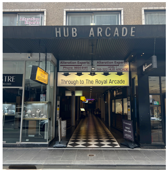
View of Hub Arcade from Little Collins Street (next to Chuckle Park Bar). The Wheelchair lift is down the arcade on left.