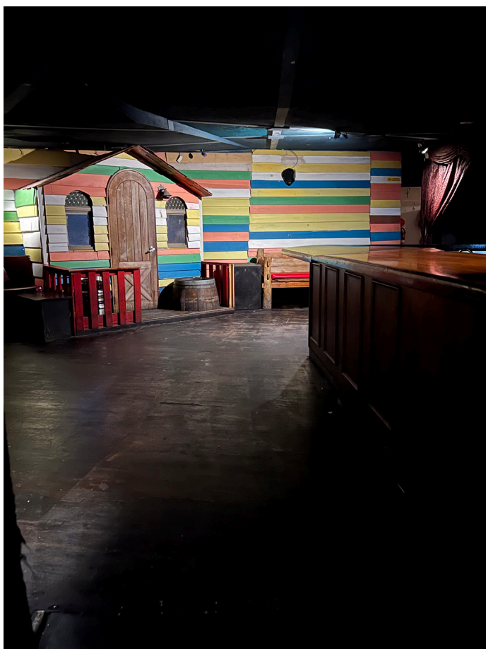
View of entry, after exiting the Wheelchair Lift. Bar on right.

There are 4 steps up to the smokers area.