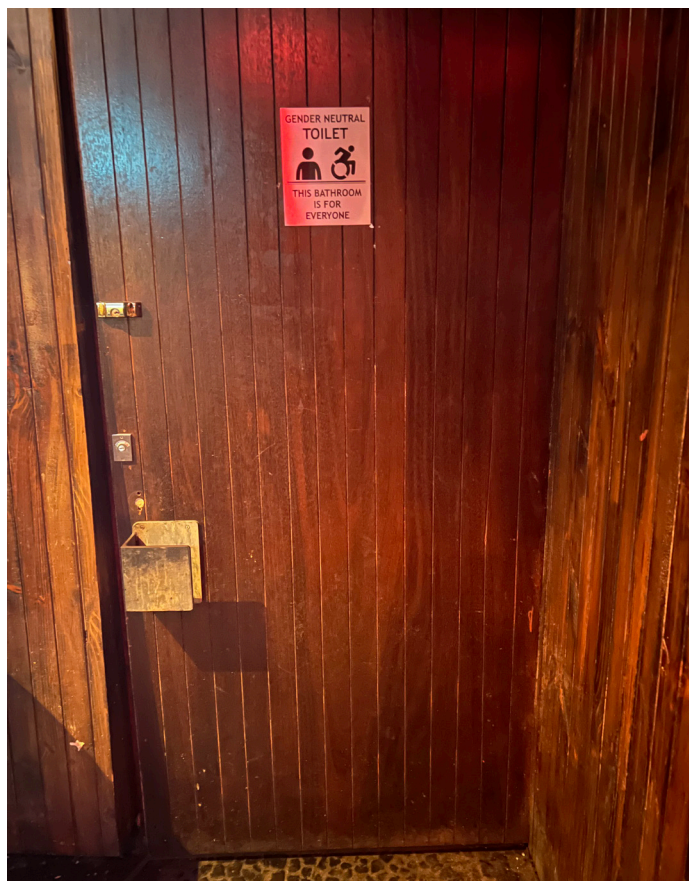
View of the Accessible & Gender Neutral toilet door.

An Accessible & Gender neutral toilet is available on Level 2.