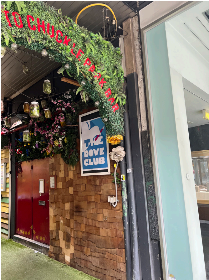
Front door/stair access to The Dove Club (via Chuckle Park Bar) Wheelchair access via Hub Arcade to right.

Wheelchair access is via the lift in the Hub Arcade. Ask Security for lift access.