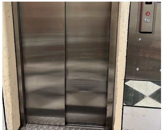
The Wheelchair lift. The Dove Club Security will assist with key access.