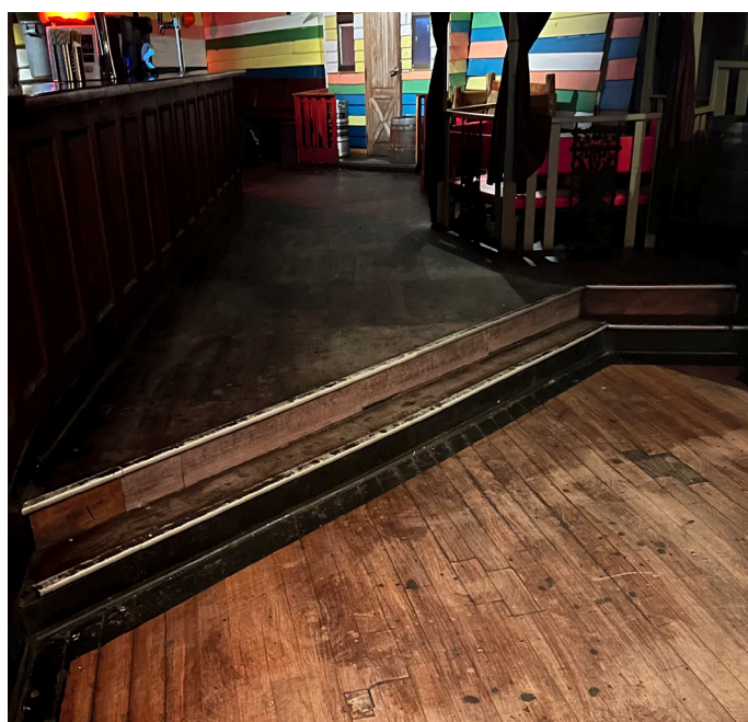
View from dancefloor, facing bar on left. 2 stairs at 15cm high each.