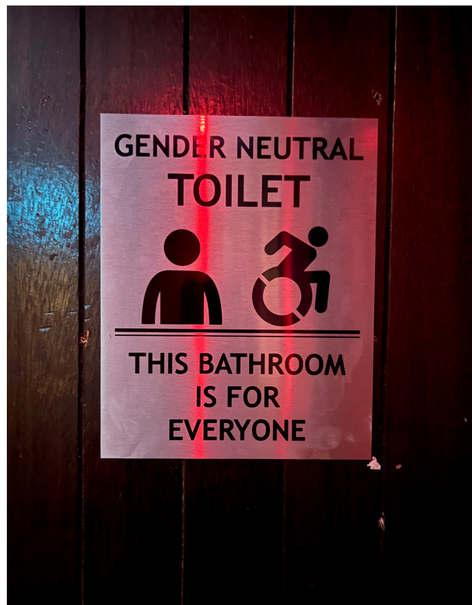
Close up of inclusivity signage on toilet.